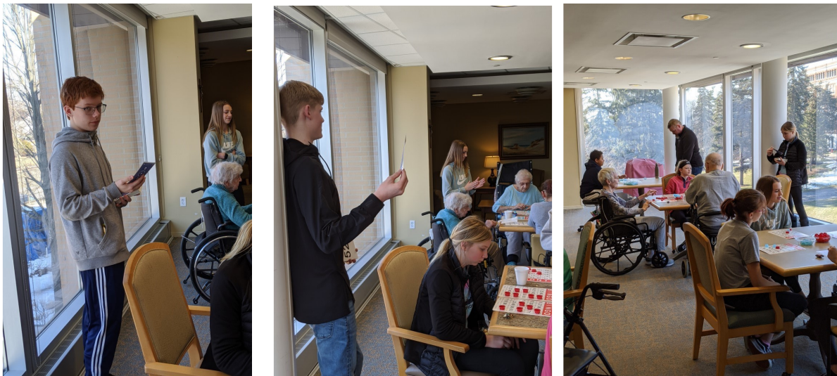
Above: Middle School Youth leading and playing Bingo at an area Nursing facility