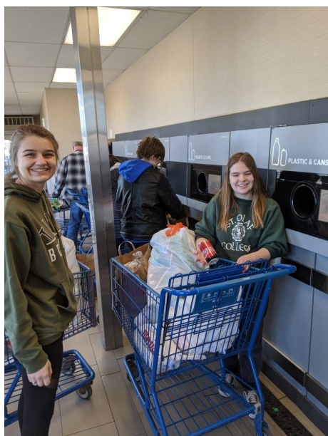
Below: High School Youth returning cans and bottles they collected during a can drive at the end of their 30 hour famine.